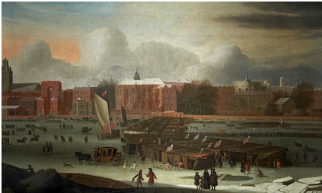
Figure 2: Abraham Hondius, A Frost Fair on the Thames at Temple Stairs. Oil painting, 1684, (32 x 19 cm). Available: https://www.museumoflondonprints.com/image/139609/abraham-hondius-a-frost-fair-on-the-thames-at-temple-stairs-1684 ou https://upload.wikimedia.org/wikipedia/commons/6/62/A-Frost-Fair-on-the-Thames-at-Temple-Stairs-1684.jpg