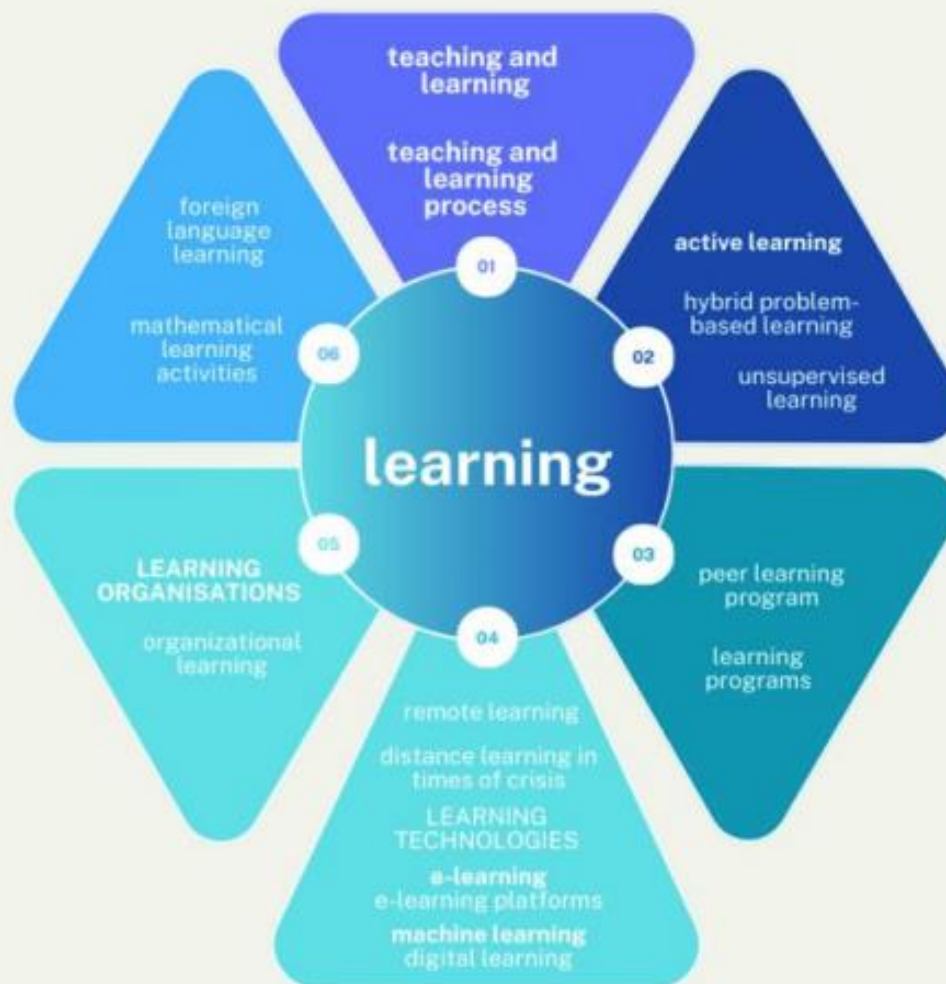
Fig. 6. Distribution chart of the keywords per title and subject targeted at learning.