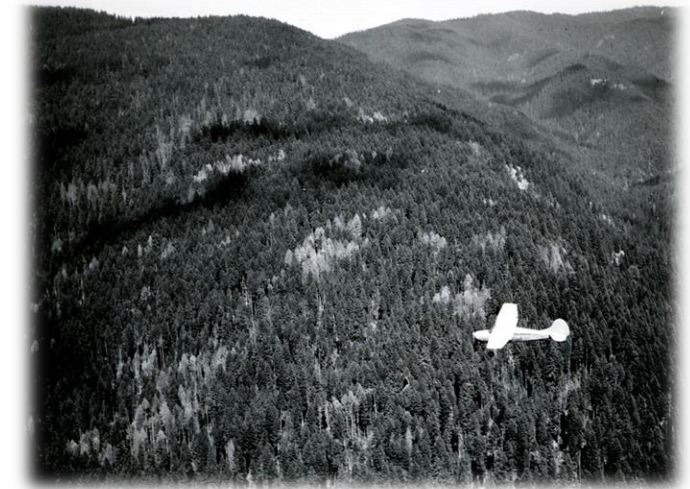
"1952. Cessna 170-B survey plane mapping Douglas-fir beetle damage near Sutherlin, Oregon."

to reach a more comprehensive understanding of what learning technologies are, how have they been evolving, specifically in both a digital transition and transformation context, the expectations regarding their function, like the purpose in learning evaluation , how they relate to assessments, and the role they play in contributing to the design of learning organizations .