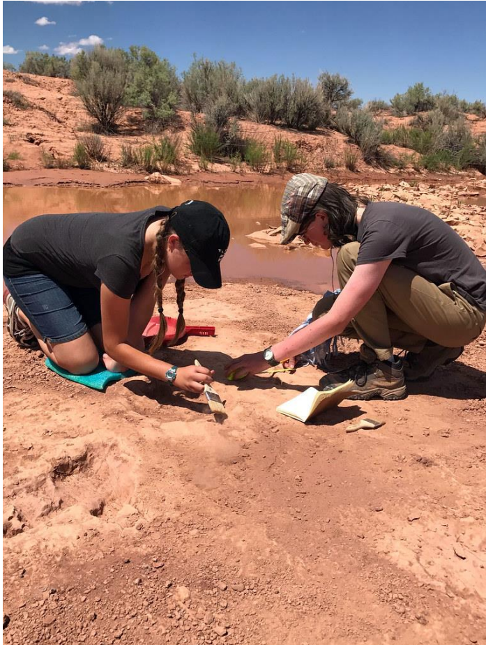
"SLCSE Paleo Campers cleaning and documenting tracks at Mail Station Site near Moab"