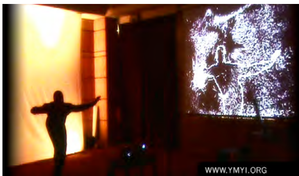
Fig. 3 The dancing actor experiencing with the artefact.

capture velocity of the system at that particular time was in fact too slow, for alien reasons. We also noticed the artefact provided an entertaining space resulting in the exploration of fun and art. Common reactions observed lead us to think on the feeling of pleasure through “fun/playfulness” present on the users’ interacting with the system: moving in several directions, seeming to play a sort of an interactive game with their virtual instantiations.