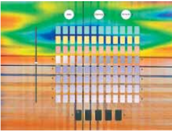
Figure 2: WAVE Screen