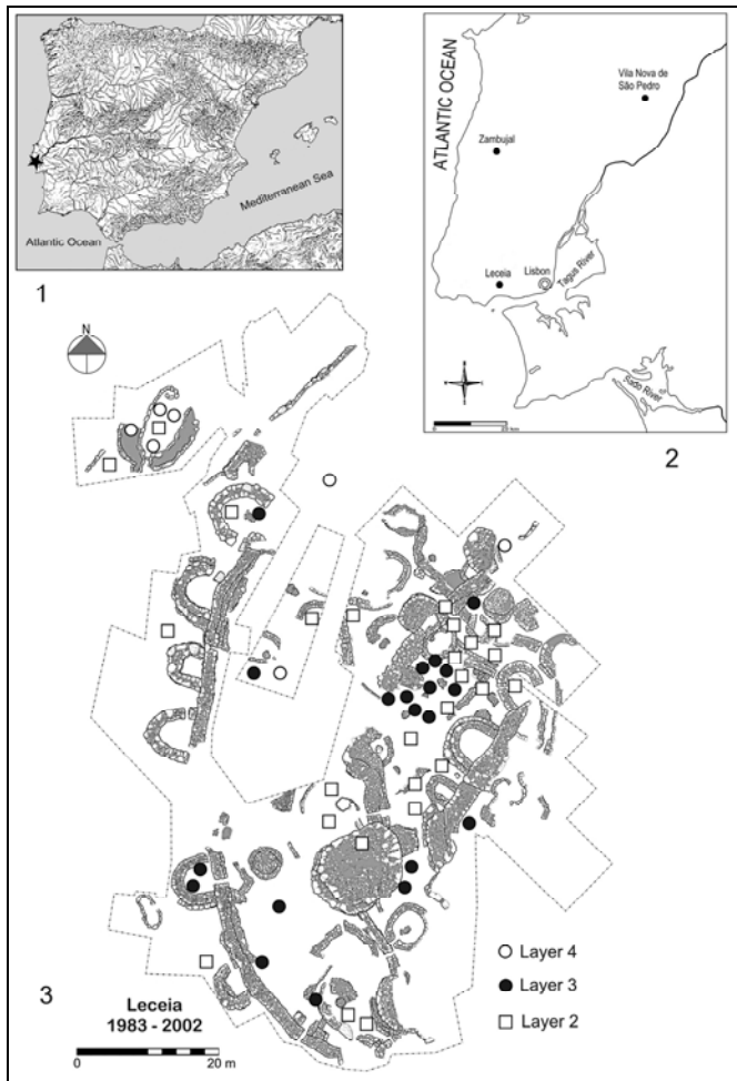
Fig. 1: 1 – Location of Leceia in the Iberian Peninsula; 2 – Location of Leceia, with the two other main Chalcolithic fortified sites in the Lower Estremadura region, Zambujal and Vila Nova de São Pedro; 3 – Plan of the excavated area in Leceia, with the location of the cult artifacts found in the Late Neolithic (Layer 4), the Early Chalcolithic (Layer 3) and the Full and Late Chalcolithic (Layer 2).

Layer 4 dates to the Late Neolithic or second half of the 4th millennium BC. It yielded six terracotta artifacts and a small baguette made of translucent calcite, likely more modern.