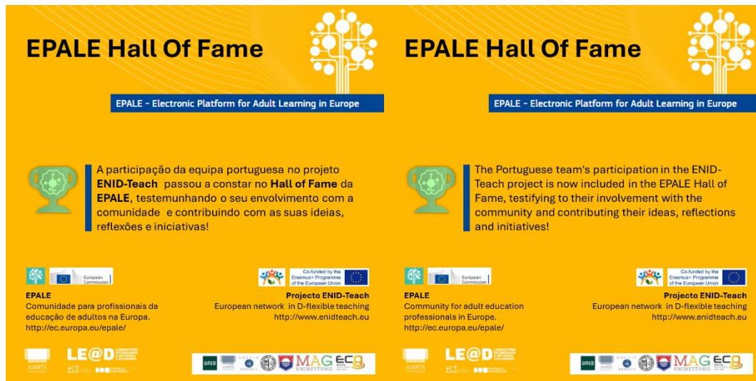
Figure 2. The flyer about EPALe HALL of FAME in Portuguese and English