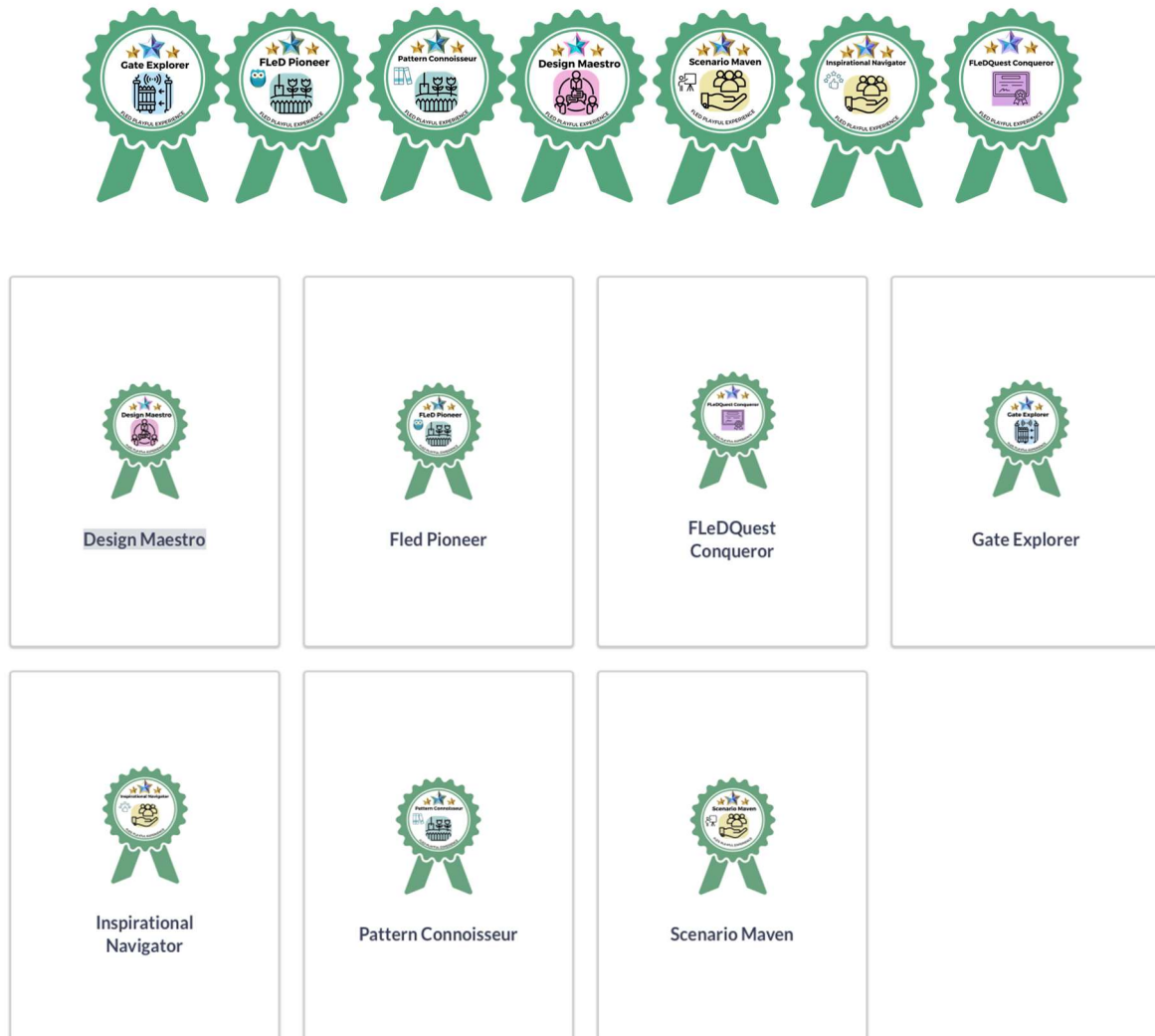
Fig. 2. The FLeD Garden Badges

"FLeDQuest Conqueror" badge is earned by completing Challenge 5, "Final Riddle," which involves answering a satisfaction survey about the FLeD experience.