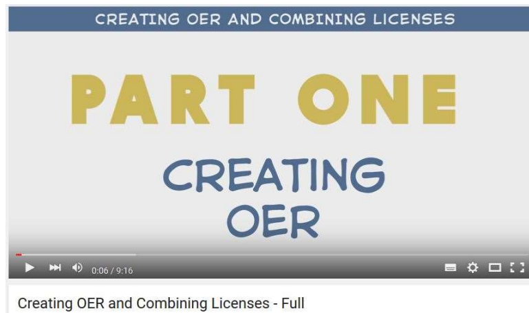
Fig 4- Video produce an OER [OGRRepository (2012). Creating an OER, https://www.youtube.com/watch?v=Hkz4q2yuQU8 ]