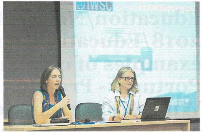
International Wikipedia Scientific Conference Day 2 - 37

Wikipedia is an undeniable contribution to the democratization of access to information. In addition, and if we consider the student population, it is one of the main sources of research, namely for the accomplishment of curricular tasks. In this context, educational projects at Wikipedia, from basic education to higher education, have enormous potential and are highly relevant. Thus, we consider two examples of curricular integration of Wikipedia that we implemented in Portugal: a teacher training course, which took place in school of the Portuguese Basic Education, in the Lisbon district, and involved two teachers and two classes (6th and 8th grades); and the first partnership between the Wikimedia Foundation and a Portuguese University, namely the Open University (Portugal), under the Wikipedia Program at the University. From these examples we recognize that it is important, on the one hand, to focus on the training of teachers, and with them explore the potential of Wikipedia; and, on the other hand, to promote the curricular integration of Wikipedia, through the Wikipedia Education Program or the Wikipedia in University Program. In short, we can conclude that Wikipedia, an open educational resource (OER) par excellence, can and should be integrated curricularly into elementary or basic education and higher education.