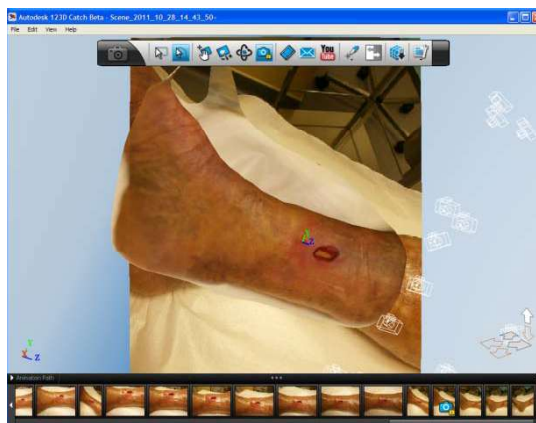
Figure 2. Creating a 3D wound with Autodesk® 123D® Catch

After producing the objects the files were uploaded to ViewAR, a software that uses printed markers to show the 3D objects in AR, when detected by an iPad with the application installed ( http://viewar.com ). At the moment this software is only available for commercial use. Alternatives to create AR experiences: Aurasma https://www.aurasma.com (free); Augment http://www.augment.com (30 day trial version).