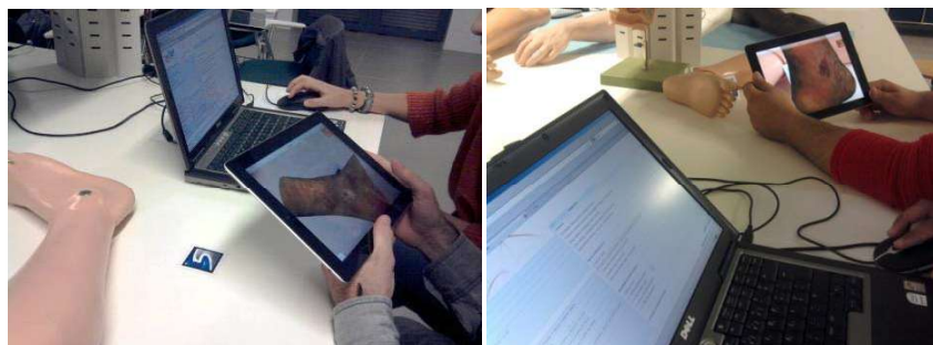
Figure 3. Students from the experimental group solving clinical cases with e-Fer while using AR to observe the chronic wounds

A quasi experimental study with pre and post test was conducted with 54 participants that started the activity by solving clinical cases on e-Fer during 2 weeks. After this period participants were split into control group (n = 24) and experimental group (n = 30) for the second part of the activity. The control group kept solving clinical cases as they were used to in the e-Fer simulator. The experimental group also solved the clinical cases using e-Fer, but observed and analysed the wounds with AR (Figure 3).