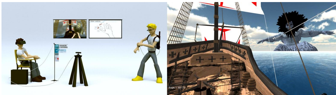
Figure 1. 3D conceptual model and in-game environment.

consists of the Helmsman (Player 1) of Vasco da Gama's ship and the Adamastor giant (Player 2), facing each other in a virtual reality (VR) world (cf., Figure 1). In its early stages, the version used in the first two case studies, Player 1 used Oculus Rift DK2 to immerse in the ship rear deck and freely observe the richness of the scenery in 360°: the ship, the sea, and the Adamastor giant. The latter was able to move his torso and arms according to Player 2 body movements captured by a Microsoft Kinect 2, using a Unity package developed by Filkov (2014).