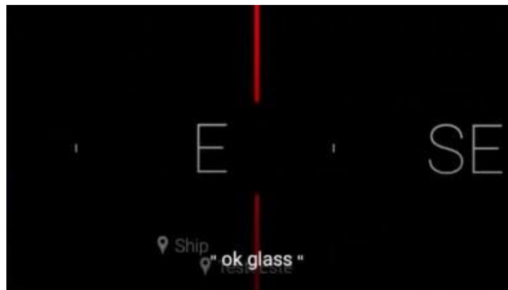
Figure 3. Player's 2 Point of View.

Player 2, on the other hand, doesn't use a headset in spite of Adamastor being stranded on the Cape of Good Hope within the VR world. Player 2, while controlling Adamastor's torso and arms through body movements detected by Kinect, uses Google Glass to access contextual information such as the current position of the ship in the virtual world and to consequently be able to throw rocks in the desired direction by doing a throw gesture in front of the Kinect (cf., Figure 3).