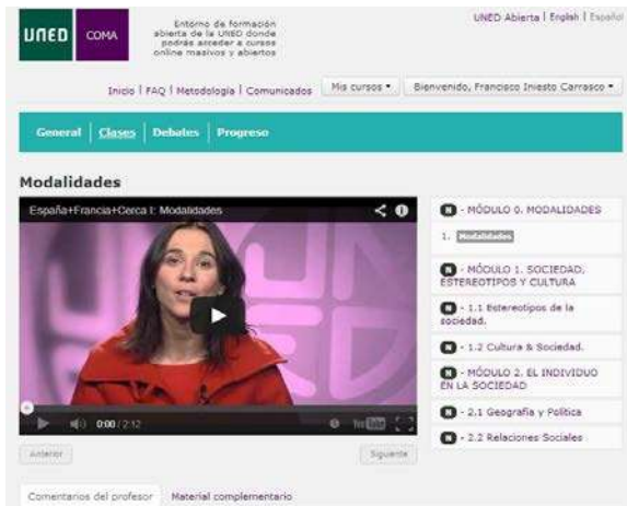
Fig. 1. Page from the "Estado del course Spain+Francia+Cerca I " course from UNED COMA