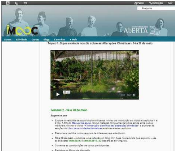
Fig. 2. Page from the "As alterações climáticas - or contexto das experiências de vida" course from UAb iMOOC

The Universidade Aberta has developed its UAb iMOOC environment “Fig. 2” through the integration of two software platforms: Moodle (development of on-line courses) and Elgg (training of communities of users). Instead of relying on the personal learning environments of the participants in the social context, the selection has been the use of Elgg, a platform of open source social networks totally integrated with Moodle by means of a single system to begin the session. Moodle (in version 2.4) is used to centralise the main information on the content, the resources, the suggested activities, timetable, etc. and it also houses the discussion forums. Elgg is a platform of open source social network services, which facilitates the training of communities, the work on the network with the exchange of archives and the collection of news via content aggregators. Everything may be shared between users, using access controls and can be catalogued by means of labels. It has a variety of web 2.0 tools and social network functionalities, enriched profiles, micro blogging, blogs, social markers, photo and video editing, recommendation systems, wiki-like pages, etc.