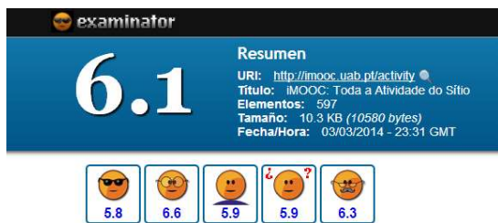
Fig. 3. Use of eXaminator in a page from the "As alterações climáticas - o contexto das experiências de vida" course from UAb iMOOC

This tool provided different scales to the set of tests carried out, with those points that have been applied in a correct and regular way being considered as excellent, bad and very bad to those which have accessibility problems according to the guidelines, the final offers a score calculated as a weighted scale. The results can be seen in Table I.