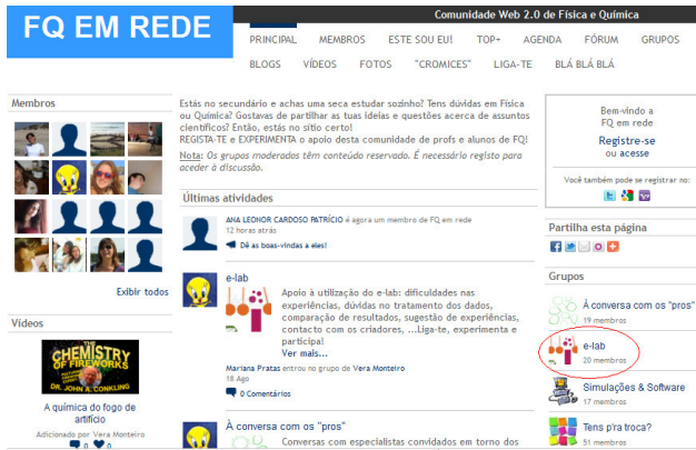
Figure 2. snapshot of “FQ em rede”, highlighting “e-lab” discussion group b

The “e-lab” chat allows to overcome the distances and sustain conversations in real time as if the players were in the same room. The associated communities allow to diversify and extend the network of contacts associated with each experience. Those open discussion forums around each activity make it a collaborative experience not constrained by the classroom space and time. This feature brings a more personalized and interactive experience relying on a credible network that share and speaks the same user language (with people with expertise to assist in whatever is needed), either for the quality and quantity of resources that are likely associated with the conversations generated this way.