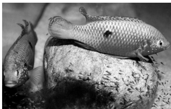
Figure 3. Cichlid Fishes with fry

In biology classes the student can observe the growth rates of the different animals and plants and register these.