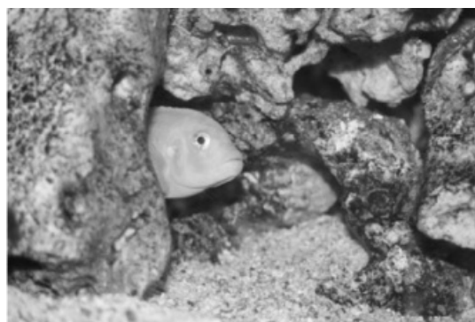
Figure 4. Cichlid Fish protecting the nest

The type of food added to fish can be also a good example to study different types of alimentation. Introduce a leaf of spinach in aquarium lead to some herbivorous fishes going to eat it and some carnivorous will try it and then throw out the spinach. Is interesting observe some herbivorous graze on algae that grow in glasses and decorative things.